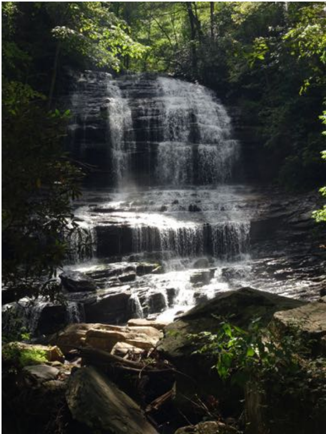
The falls at dusk