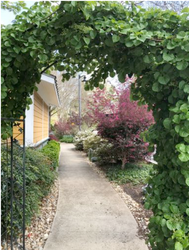
Through the climbing hydrangea arbor into the Depot Garden