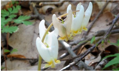
Spring bloom at Pearson's Falls