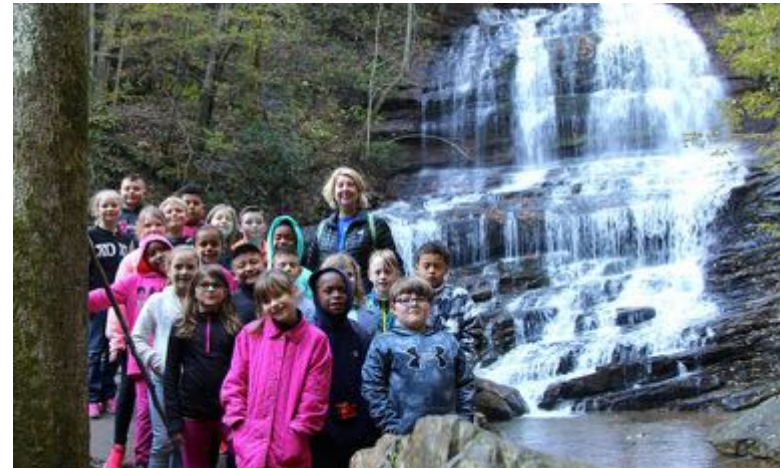
Tryon Elementary School third grade students and teachers

Our education committee is hard at work to involve more Polk County schools in our programs.