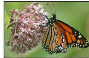
Habitatscape with native plants to support pollinators and wildlife!

This event is dedicated to promoting the use of native plants in sustainable gardening and furthering the efforts to restore biodiversity in our region.