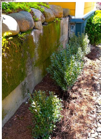
Before & After Top: Nandina hedge Bottom: New Inkberry hedge

provided green and gold groundcover. Other groundcovers/low-growing perennials include creeping phlox, mouse-eared coreopsis, self-heal, and Pennsylvania sedge. New shrubs include a buttonbush, hummingbird clethra, cinnamon bark clethra, Virginia sweetspire, low-growing chokeberry, and low-growing sumac.