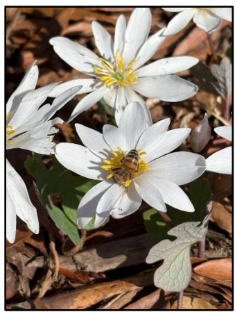
Depot Garden early March Bloodroot All Depot Garden photos by Corrie Woods

Corrie Woods and Beth Rounds, the new co-managers of the Depot Garden, like to think of it as a living, breathing gift to the community. On any given day a surprising number of folks stroll the garden, walk and wander with their dogs, or sit for a spell in the garden’s shade and quiet. Over the years, many dedicated volunteers have stepped in to manage and/or contribute to the garden’s upkeep and add their ideas for enhancements that include an irrigation system,