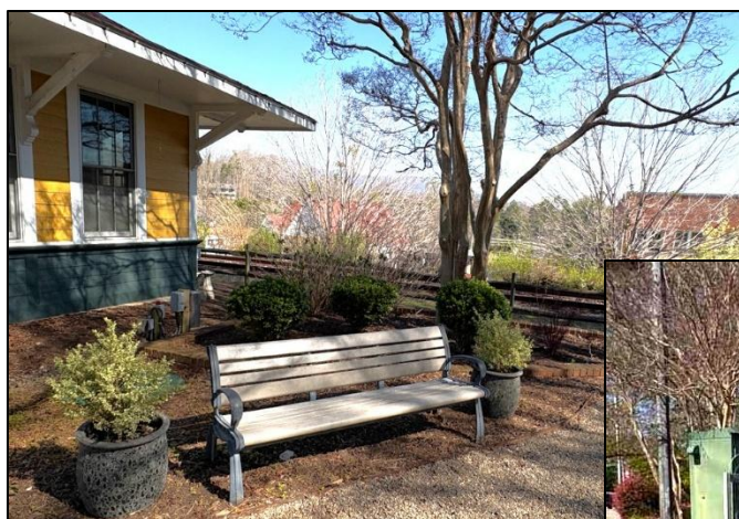
Top: The garden's new planters Bottom left: Low-growing chokeberry, leucothoe, phlox, & coreopsis at parking lot entrance Bottom right: Spruced up Pacolet Street entrance

The attack on invasives continues. The nandina hedge along the walkway was replaced with inkberries. A patch of lirioppe was traded for Pennsylvania sedge and penstemon. Vinca is out and Christmas fern and coral bells are in. The hellebore bed has been dug up and the plants have been given away. You ask, "Why did we dig the hellebores?" While hellebores are a garden favorite for many,