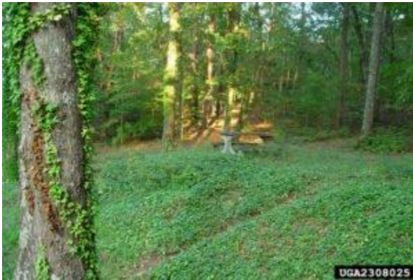
English ivy covering clearing

Invasive plants can aggressively grow across large areas, crowding out existing plants by depriving them of sunlight, water, space, and/or nutrients.