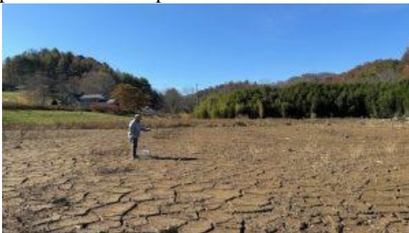
Western NC field – Post Helene

Helene's flooding and high winds may both facilitate the spread of invasive plants.