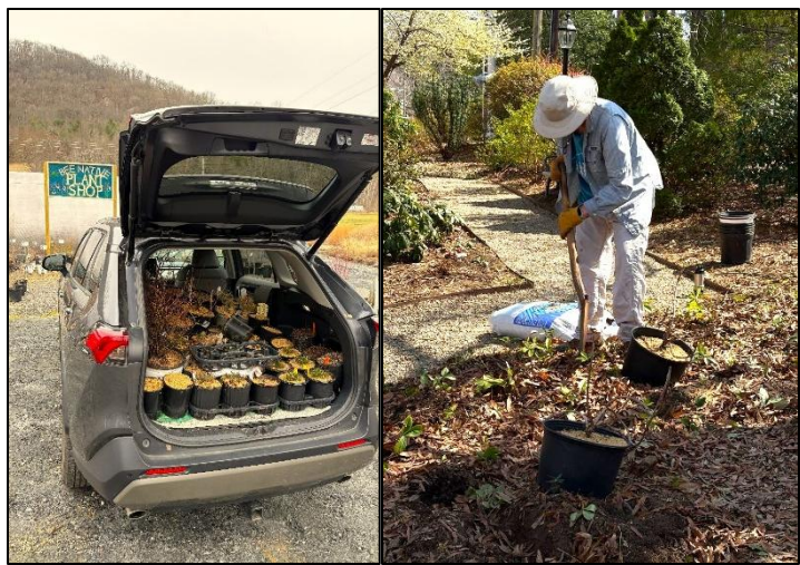
First the obtaining, loading, and unloading, then the hole digging, augmenting, and hard labor.

The list of new to the garden species is long but here are a few highlights. The garden’s first pawpaw (another will be added soon) is in the ground. There